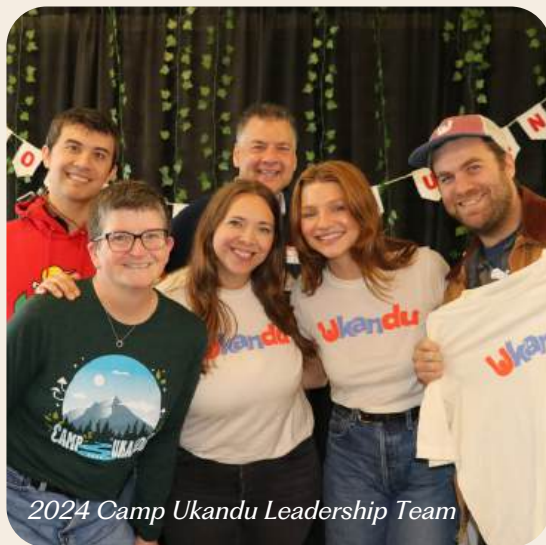
2024 Camp Ukandu Leadership Team

We are honored to receive these distinctions from ACA and COCA-I and look forward to continuing to meet and exceed the highest standards set for camping programs.